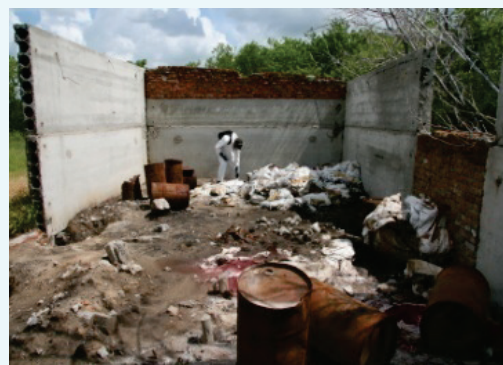
Examples of poor storage conditions